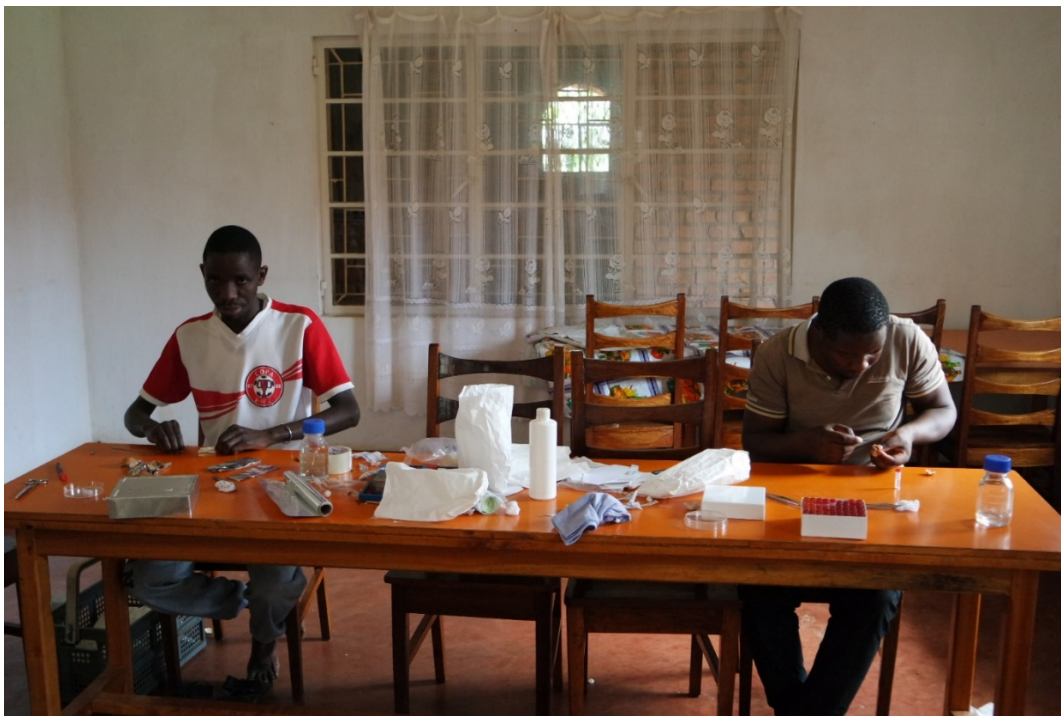
Figure 3. Back from the field, careful processing and preservation of specimens is necessary for future microscopic and molecular analyses.

Molecular analysis of macrofungi has become an indispensable part in resolving taxonomic problems, and will be needed to place and name the wealth of new taxa in DRC and tropical Africa. Equipping local laboratories for both microscopical and molecular analysis of fungi, as well as the reinforcement of the north-south scientific collaboration, would be ideal for promoting Congolese mycology. As most local research institutes and Universities can't overcome the gigantic cost for installing and sustaining a molecular lab, this technique is only available via collaboration with colleagues abroad. In situations like this, mycologists with different opportunities and skills, should collaborate and look for complementarity. The interest and need for specimens from tropical Africa, expressed by molecular labs conducting global phylogenetic research, is huge and growing. This can easily be deduced from phylogenetic studies (in for example Amanita , Tylopilus , Lentinula ) that actually lack specimens from continental tropical Africa (CAI et al. 2014; CHAKRABORTY et al. 2018; VARGA et al. 2019; LOONEY et al. 2021). This shows the opportunity and the unique role local African mycologists can play in taxonomic and phylogenetic research (Fig. 3).